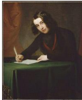
Charles Dickens (1842)