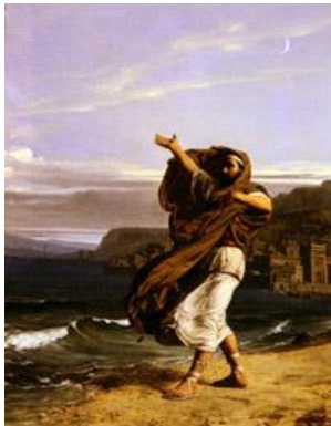
Demosthenes Practising Oratory (1870)

http://www.d.umn.edu/cla/faculty/troufs/anth1095/gcproject.html#title .